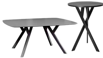
Felber T14 Table