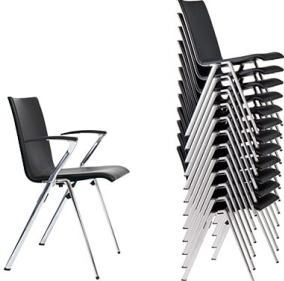
Men - Collection