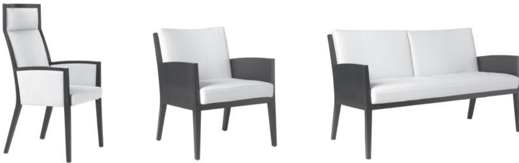
High back chair · Lounge · Lounge 2-seater