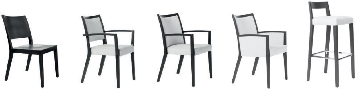
Chair · Easy chair · Bar stool