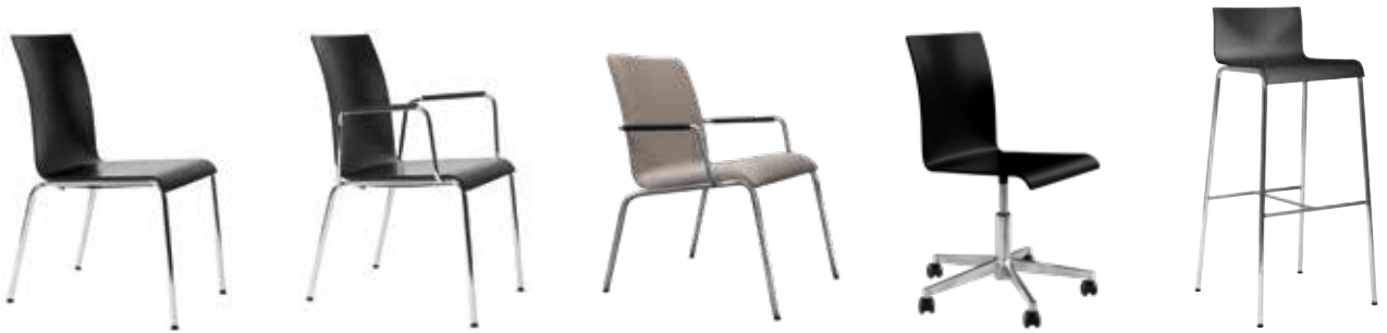
Chair · Lounge · Studio chair · Bar stool