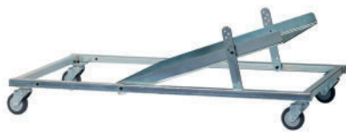
Transport cart "Multi"