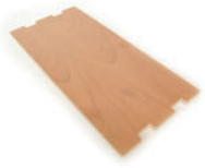
Linking device, connecting board