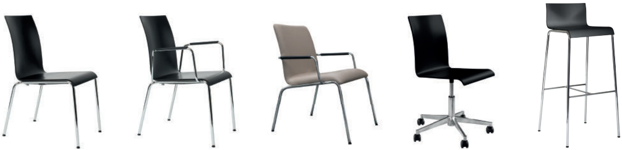
Chair · Lounge · Studio chair · Bar stool