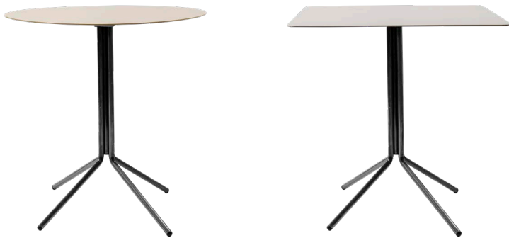
Outdoor table frame type I