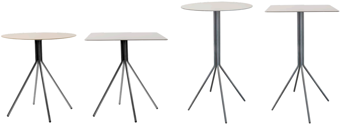
Outdoor table frame type A